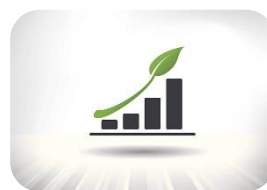
Green finance and financial inclusion

The organization has been effectively and efficiently services in the said sectors with support and cooperation from operation of both government and non-government stakeholders. Providing quality research and advocacy services to numerous national as well as international organization has earned Unnayan Shamannay the reputation of a leading think tank of the country as well as the of the South Asia region. The organization has associated with a pool of experts constituted of young enthusiastic researchers as well as veteran development thinkers/practitioners with international exposure and reputation. The organization also maintains a rich set of core staff, a state of the art head office at Dhaka, Bangladesh, a strong and efficient administrative support team, and logistics capacities that match with the international standards.