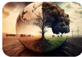
Climate change, environment and energy policy