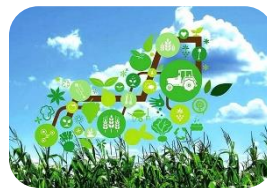
Agriculture, forestry and fisheries