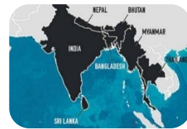
Regional trade and connectivity