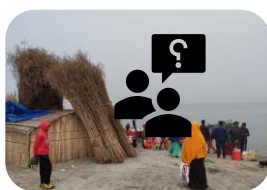
Poverty, and livelihoods