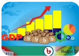
National budget and public finance