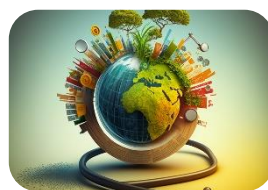
Health and education planning